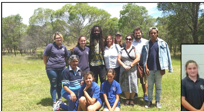
BCS students and staff with a U.N. Ambassador from Africa.