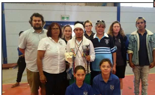
BCS group with an Indigenous leader from Mexico.