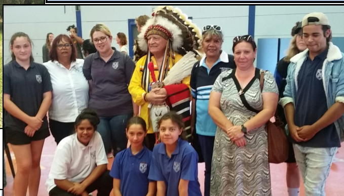
Students and staff with a Chief and Indigenous leader from Canada.