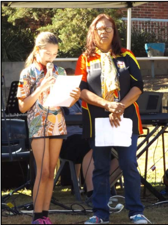
Our Student Representative Council for Semester 2