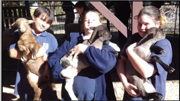
Some recent additions to our Ag Dept.

Keep up to date by following Second Hand Saturday on Facebook. Choose to reuse – it's how we roll on the North Coast!