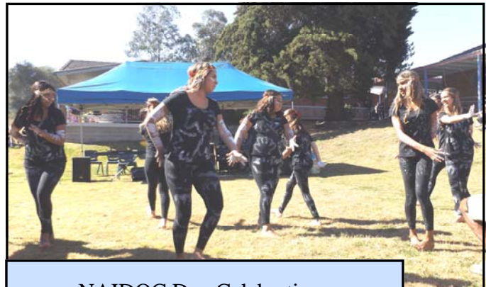
NAIDOC Day Celebrations