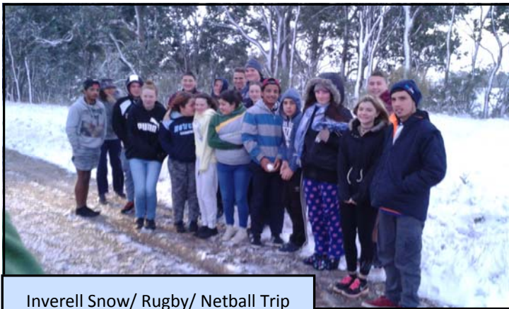
Inverell Snow/ Rugby/ Netball Trip