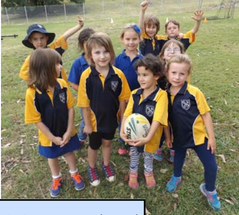
K/1 enjoying sports on the oval