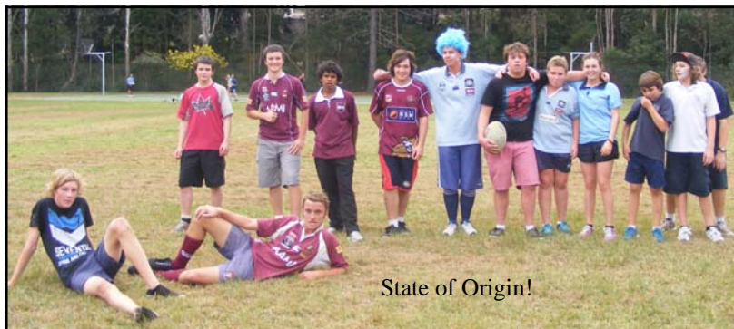
State of Origin!