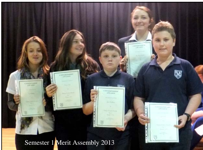
Semester 1 Merit Assembly 2013