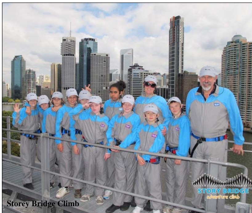
Story Bridge Climb