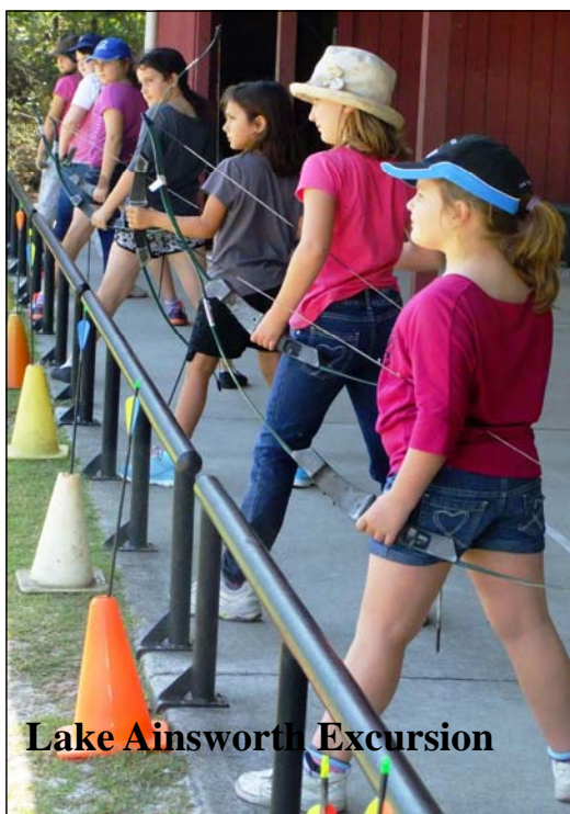
Lake Ainsworth Excursion