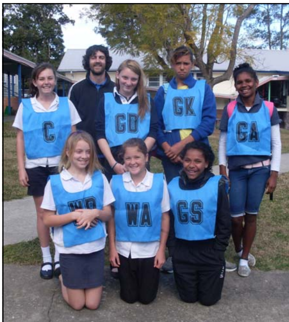
←The Winning Year 7 Netball Team.