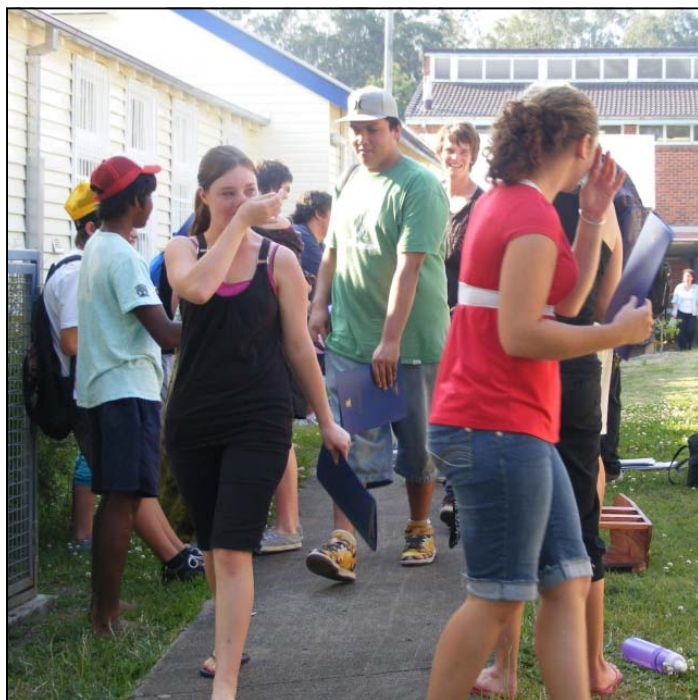
Mufti Day/Goodbye Year 12 ↑ African Famine Day / Mufti Day ➔