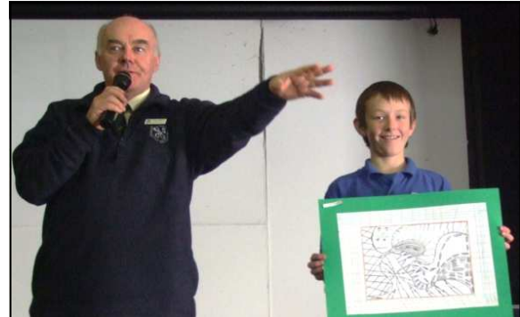
Primary Art Auction