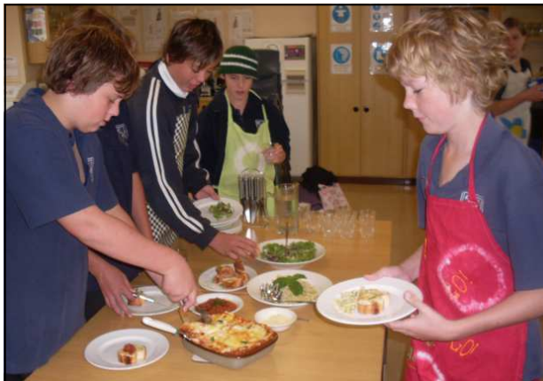
Year 8 Food Tech students ↓