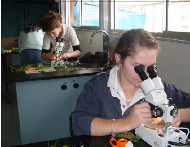
Working in the new Science Centre ↑