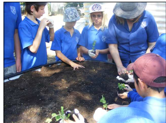
↑ Green Up, Clean Up