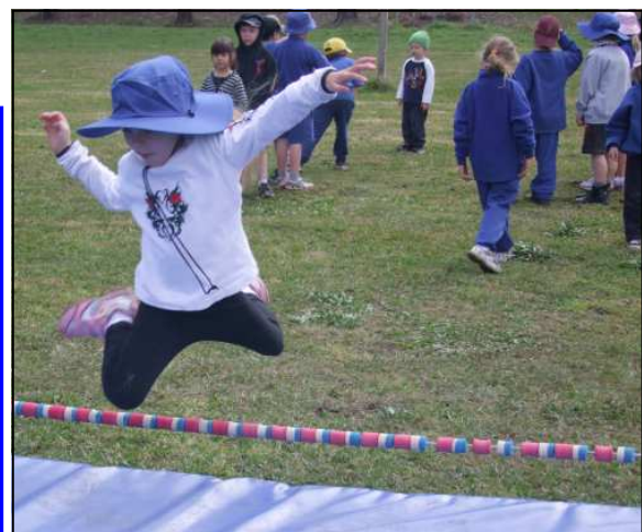
Primary Athletics ↓